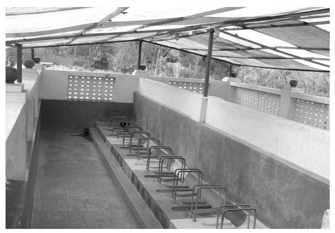
Photo 3: Community-designed children's toilets in Byanapalli settlement, Bangalore.

defecate in the open. Children under the age of seven comprise a significant proportion of the slum population – often one-quarter of the total. The children's toilets were specially designed to include smaller squat plates, handles to prevent overbalancing, and smaller pit openings into a shallow trench that is flushed regularly. Many toilet blocks also included toilets designed for easier use by the elderly and the disabled.