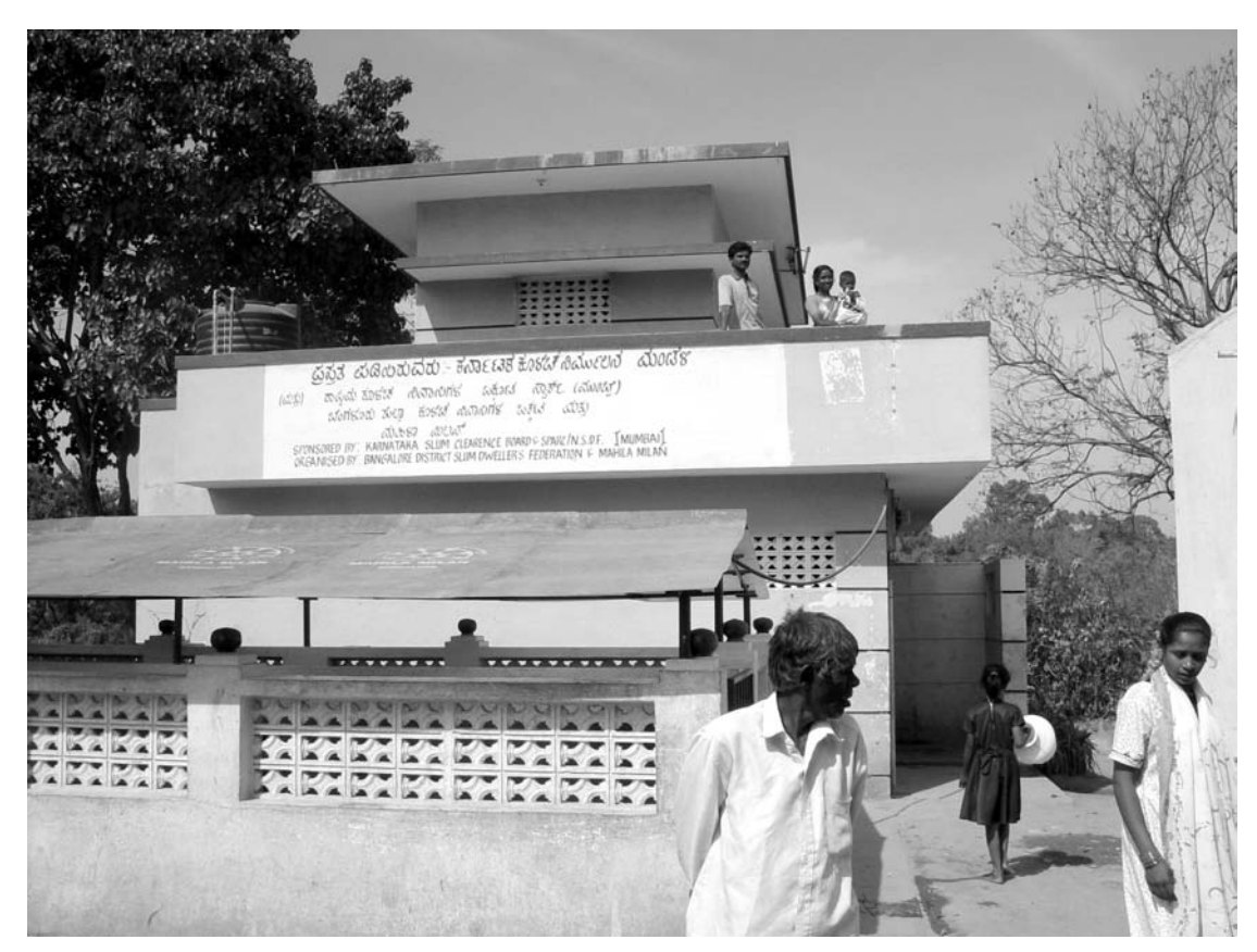
Photo 1: Aundh toilet block built by the community in Bangalore.

donors. This followed the Alliance's long-established practice of supporting urban poor community organizations that want to try out new ways of addressing their problems, learn from these experiences and, over time, develop precedents and practices that work. These precedents then serve to show municipalities and donors what community organizations are capable of doing. This was also to demonstrate to international donors that community toilets were a solution.